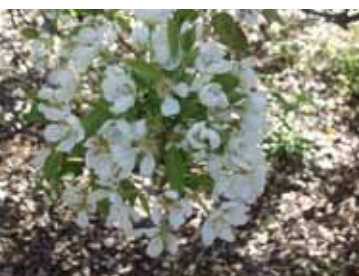
Original Fruit and Olive trees