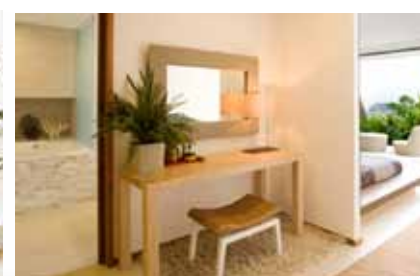
Home images for illustrative purposes only

Once an orchard filled with blossoming fruit trees, this amazing piece of land is now up for sale.