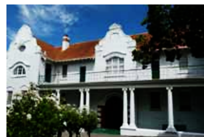
St Brigid's College