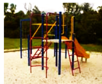
Flora Terrace Reserve